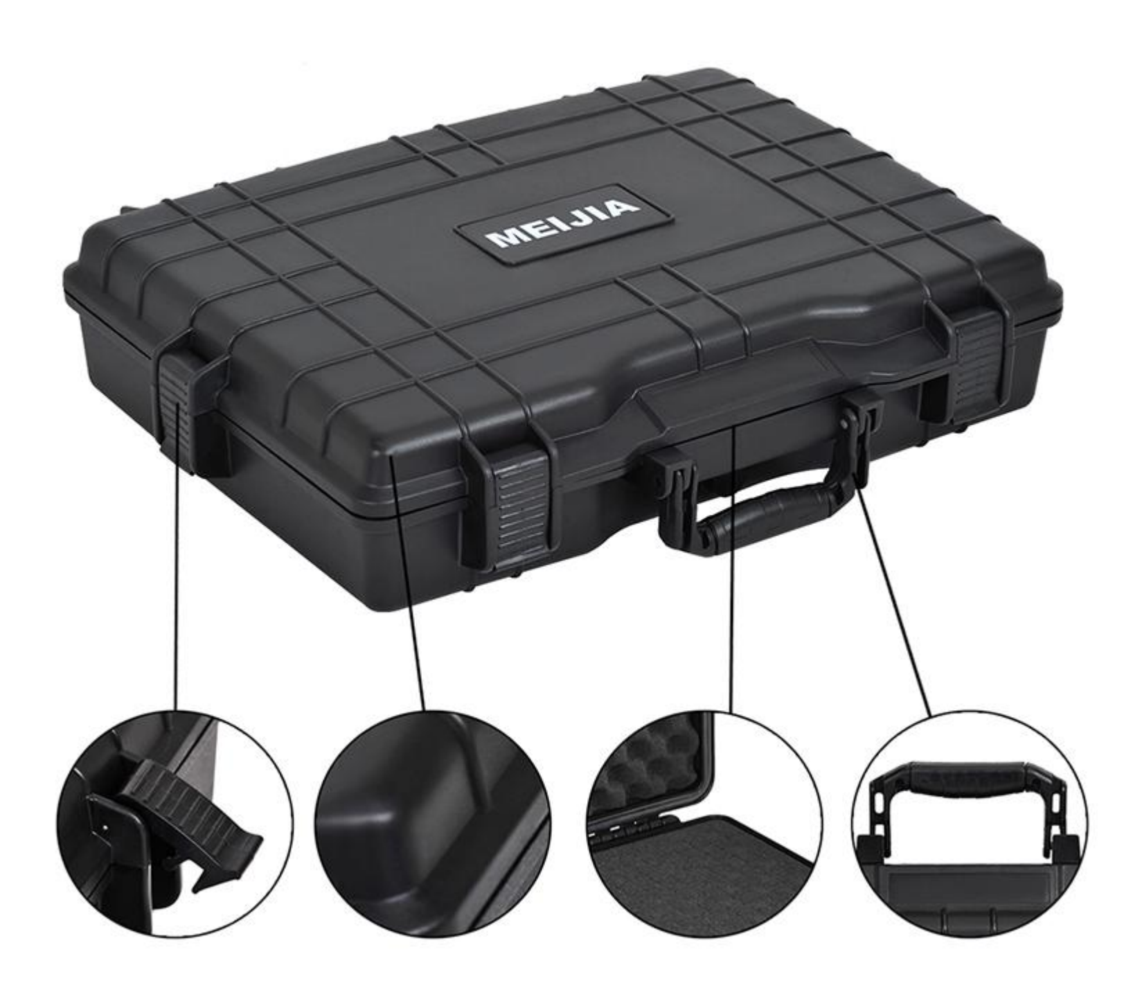
Easy To Open With Latches Design Smarter and easier to open than traditional cases. Start the release and offers plenty of leverage to open with a light pull in just seconds.